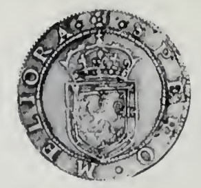
Lot No. 2919

2919 King James VI, 1567-1625. Seventh Coinage. Gold Rider, 1593. Obv. Mounted Ruler flourishing sword. Rv. Crowned Arms. S.5458. Very Fine. (1,500-1,750)